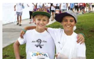
Marching in Brisbane.