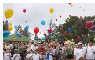
Wollongong's symbolic balloon release.